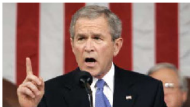
Bush has come through for physicists, but the budget is harsher on others.

On 6 February, physical scientists in the United States got some rare news: a big funding boost for next year, courtesy of President George W. Bush. But it seems that the budget for other disciplines must remain flat, or drop slightly, to make up for the physics push in a science budget that drops slightly overall.