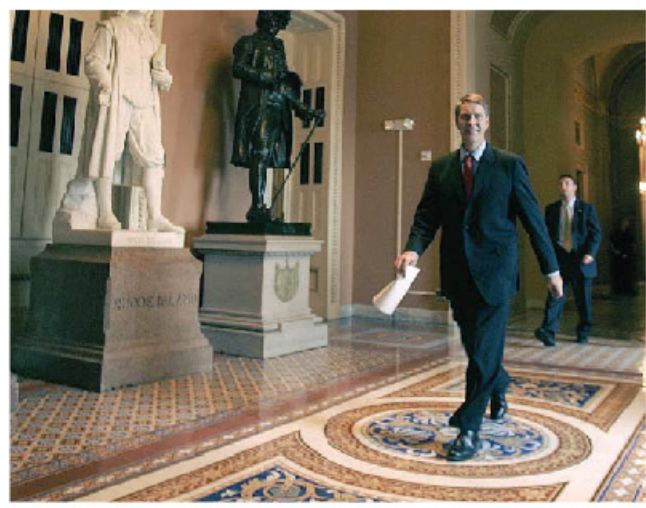
Bill Frist heads for the Senate to announce his support for changes to rules on stem-cell research.